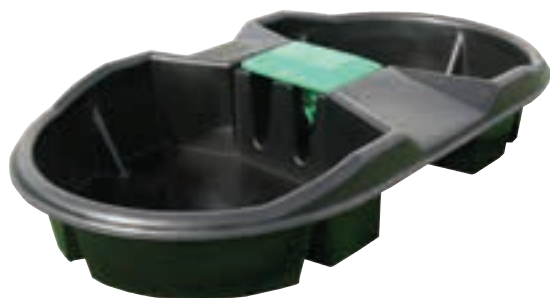
RXTR350LRTB 350 litre trough - black (1935mm x 1100mm x 380mm deep)