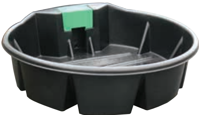
RXTR1200LRB 1200 litre trough - black (2130mm x 580mm deep)