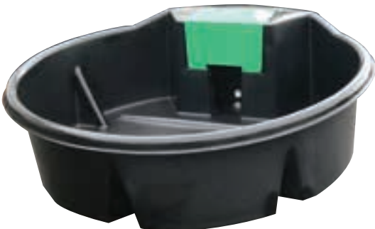
RXTR500LRDB 500 litre trough - black (1620mm x 420mm deep)